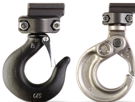
Swivel Hook with latch