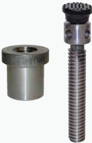
SCN15 & SC156 Shown

Sustaining Capacity ..... ► 12 - 24 tons Thread Pitch Range..... ► 1.5 - 3 in. Weight Range..... ► 5.5 - 29.25 lbs.