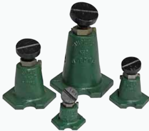
PJ1P, PJ2P, PJ3P & PJ4P Shown