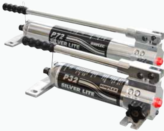
P32 & P72 Shown

Reservoir Capacity .....▶ 30 - 70 cu.in. Weight .....▶ 8 - 11 lbs. Maximum Pressure .....▶ 10,000 psi