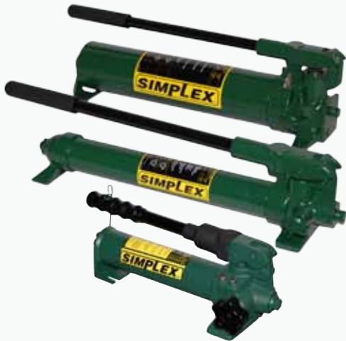
P82A, P41A & P22 Shown

Reservoir Capacity .....▶ 20 - 134 cu.in. Weight .....▶ 10 - 24 lbs. Maximum Pressure .....▶ 10,000 psi