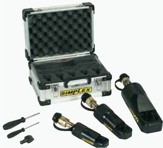
NS Series Shown

Nut Range .....► .5 - 2.88 in. Weight .....► 1.8 - 75.1 lbs. Maximum Pressure .....► 10,000 psi