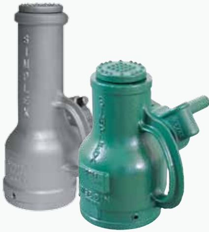
JJA2515C, JJ2510C Shown