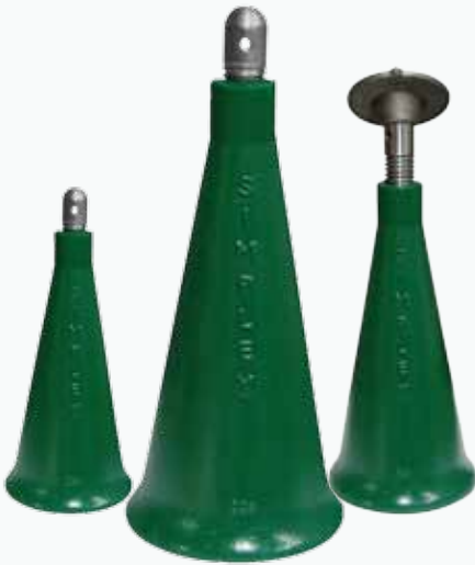
Tank Jack Family Shown