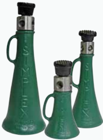
Mechanical Screw Jack Family Shown

Capacity Range .....► 12 - 24 tons Stroke Range .....► 3.75 - 14.25 in. Minimum Height .....► 9.62 - 23 in.